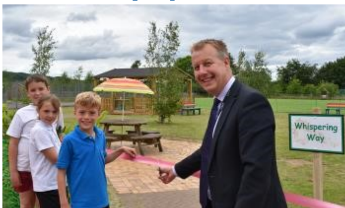
Y6 pupils selected to officially open Whispering Way.

The school community is now able to enjoy their new learning space named 'Whispering Way'. In addition to the planting of new trees and hedges, the outdoor space now boasts a fantastic outdoor classroom and seating areas.