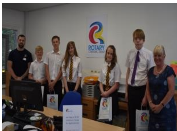
Students from SHS and Baxter College enjoyed a morning with staff from Rotary Creative Print