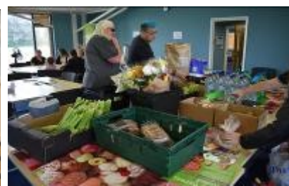
Parents, students and staff involved in the community events at Stourport High and St Bartholomew's