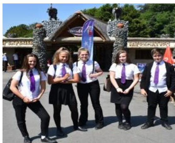
Students from Baxter College at West Midlands Safari Park